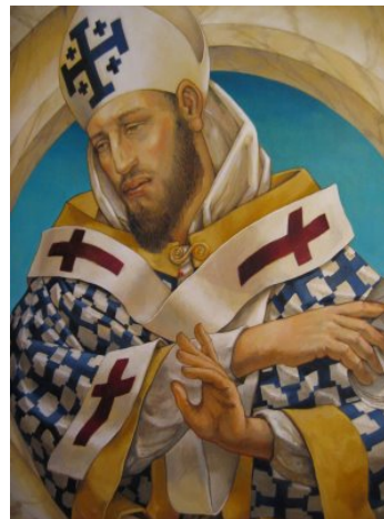
Saint Cyril of Jerusalem, Father, Bishop and Doctor of the Church

Cyril of Jerusalem was given to the study of the Holy Scriptures from childhood, and made such progress that he became an eminent champion of the orthodox faith. He embraced the monastic institute and bound himself to perpetual chastity and austerity of life. He was ordained priest by St. Maximus, Patriarch of Jerusalem, and undertook the work of preaching to the faithful and instructing the catechumens, in which he won the praise of all. He was the author of those truly wonderful Catechetical Instructions , which embrace clearly and fully all the teaching of the Church, and contain an excellent defense of each of the dogmas of religion against the enemies of the faith. His treatment of these subjects is so distinct and clear that he refuted